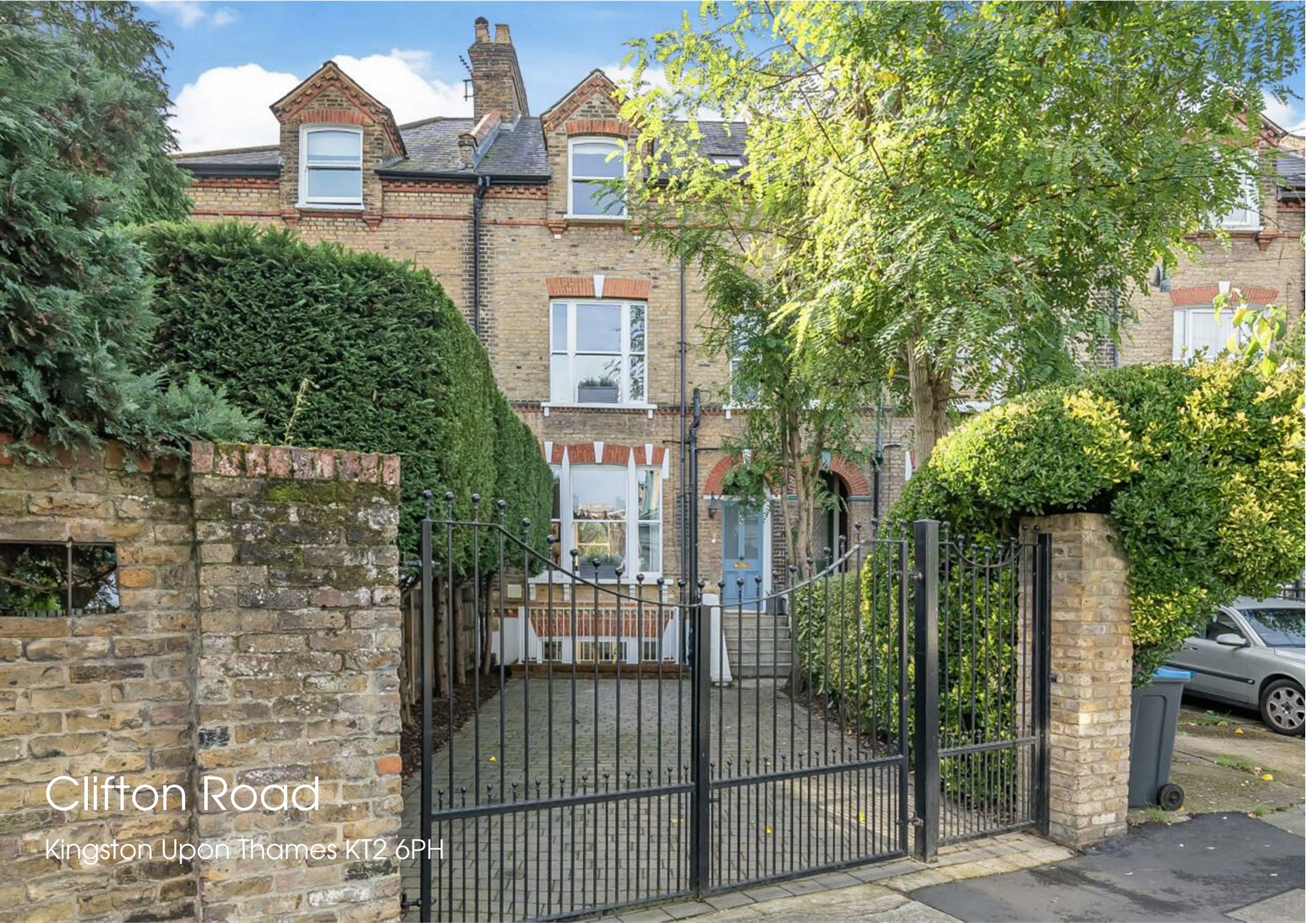
Clifton Road Kingston Upon Thames KT2 6PH